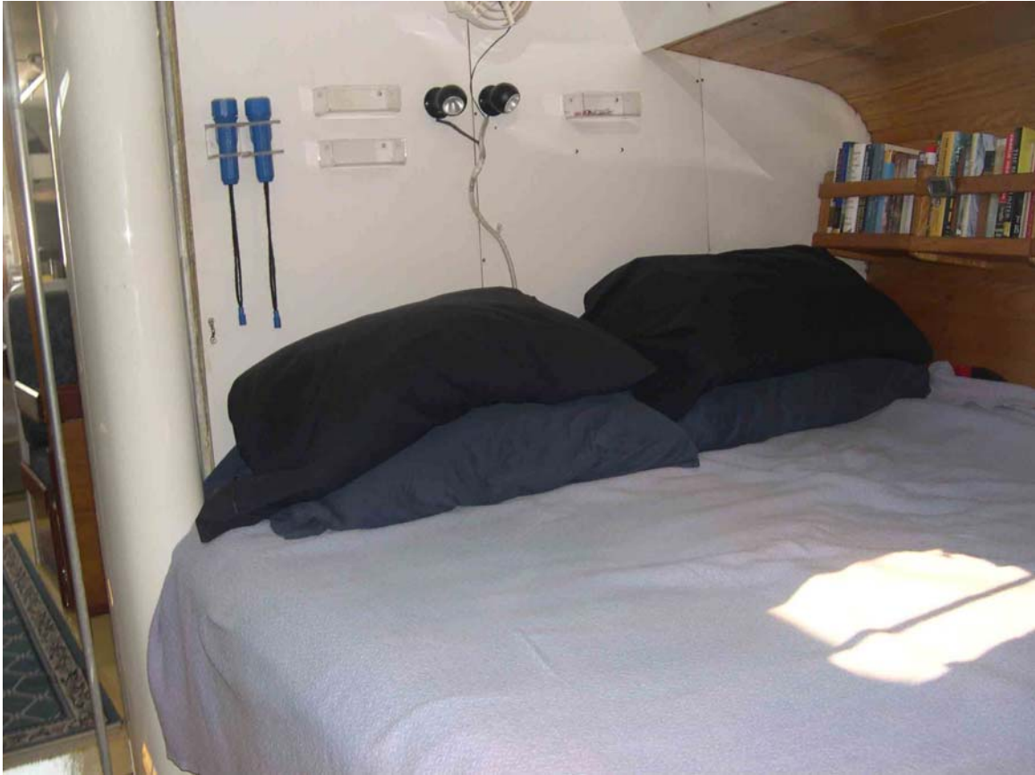
The forward cabin has a large double bunk. Note the wood ceiling outboard which extends up under the deck.