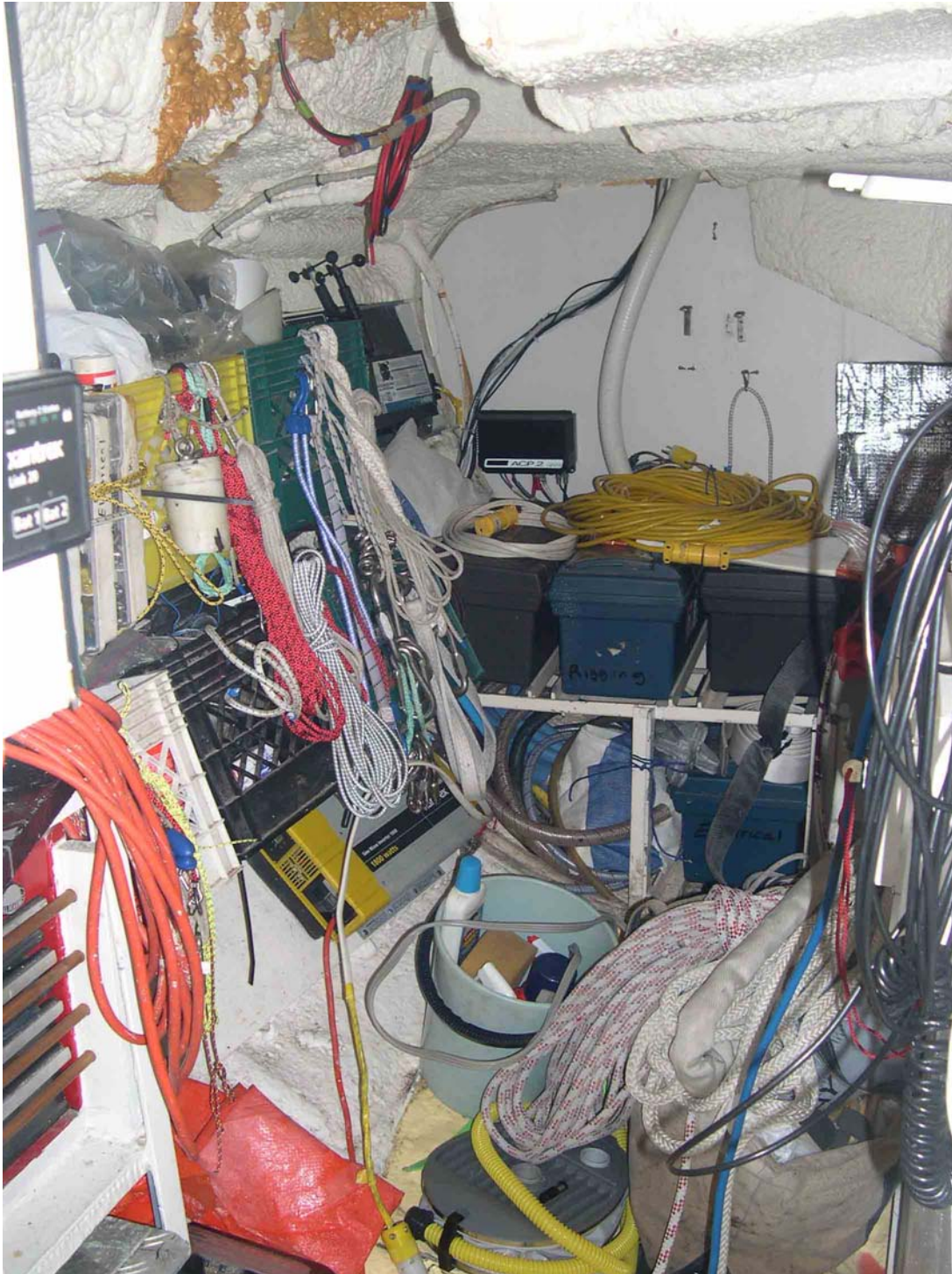
On the starboard side aft is the 'garage'. The area overhead is sprayed with 3 inches of fire-resistant polyurethane foam. On the aft bulkhead is the B&G autopilot computer. Outboard are an inverter (yellow) and battery charger (black). The battery charger works on all-voltage and all-frequency shore power.