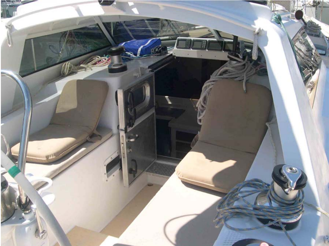
A watertight hinged door closes off the companionway under the rigid dodger. Reefing lines, main halyard and a vang control lead to the winches at the forward end of the cockpit.