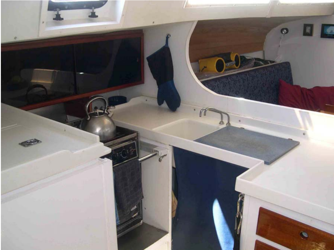
The galley includes a Seaward Princess propane stove in gimbals. The double sink is fitted with both salt and fresh water spigots. The counter is Corian, with integral sinks and fiddles. Outboard is a large locker with sliding acrylic doors.