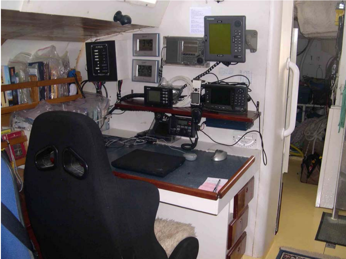
View of the nav station. From right to left on the mahogany shelf are a Northstar chart plotter (the primary navigation tool), a back-up Garmin GPS, and B&G instrument repeater. Below the shelf are a small 110-volt inverter, the Icom VHF DSC radio and a Vetus digital barograph. Above the shelf is a Furuno 4kw radar and a Sony all-band radio used to get both BBC and weatherfax. The head is aft of the nav station, and further aft is the passageway into the `garage`.