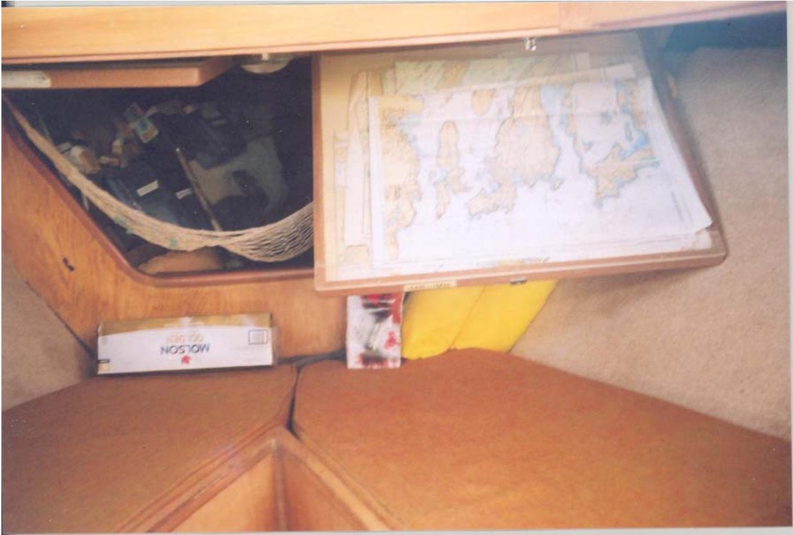
Two overhead bins in the forward cabin are used for chart stowage.