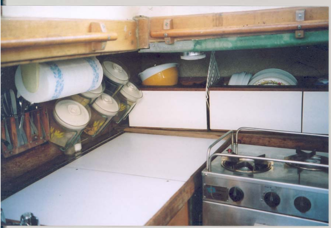
The galley on the port side includes cookie bins in wire racks and large sliding bins outboard of the stove.