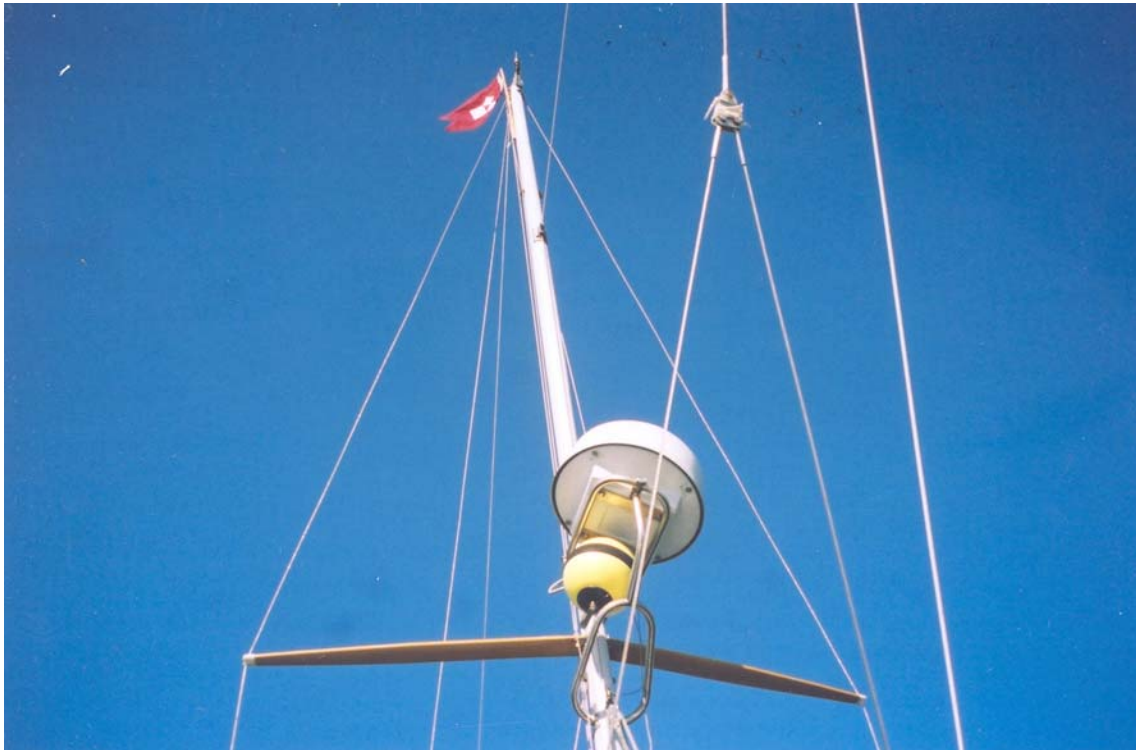
The tilting radar antenna and radar reflector are mounted on the mizzen mast.