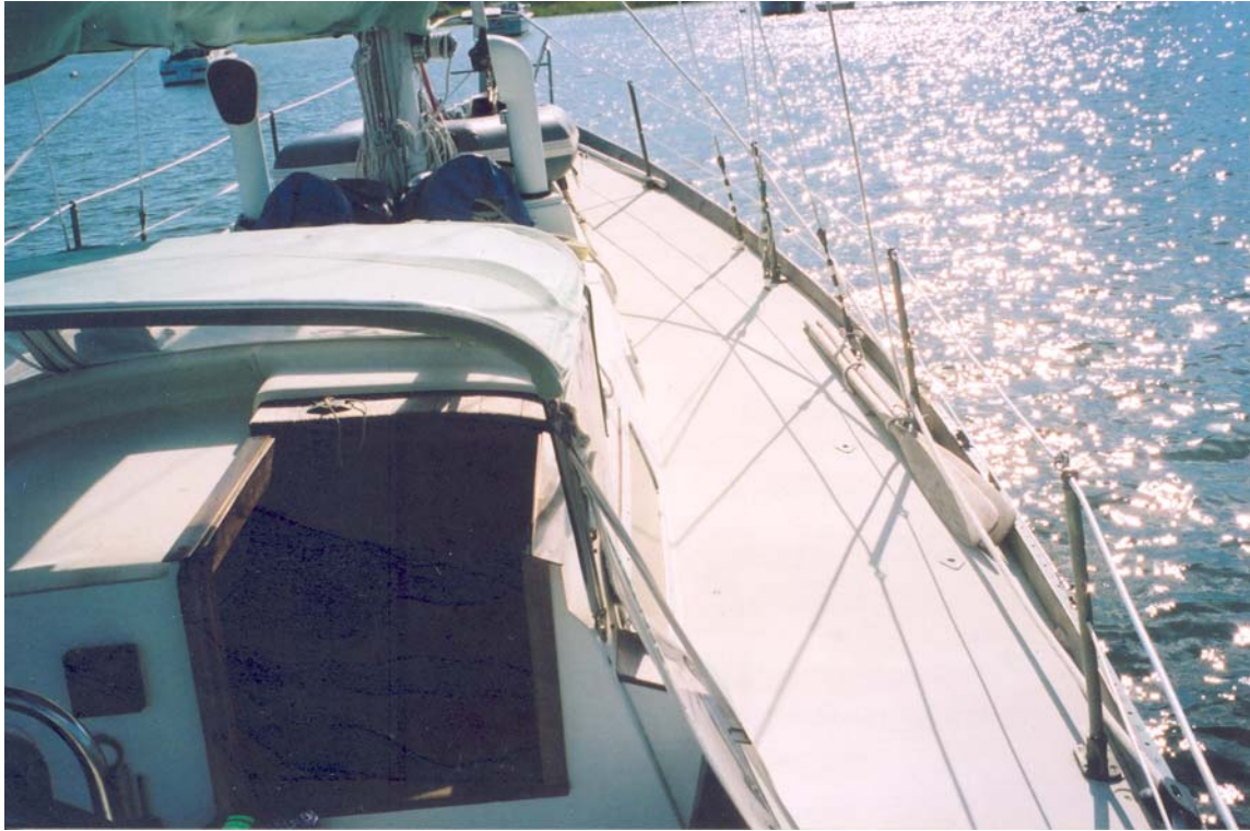
Rhubarb's wide decks are apparent in this view. The shrouds lead further outboard than in more recent designs, giving better support to the rig at the expense of a wider lead for the genoa jib.