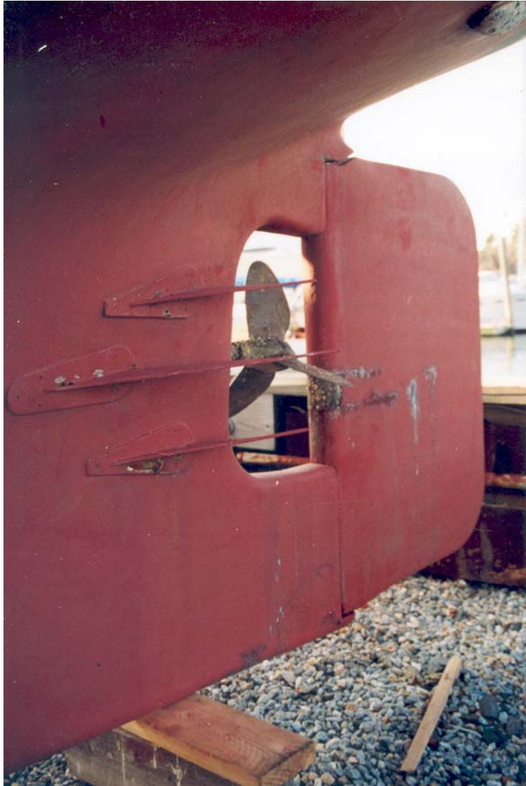
Deflectors are mounted on the keel to protect the propeller from lobster-trap lines and other flotsam.