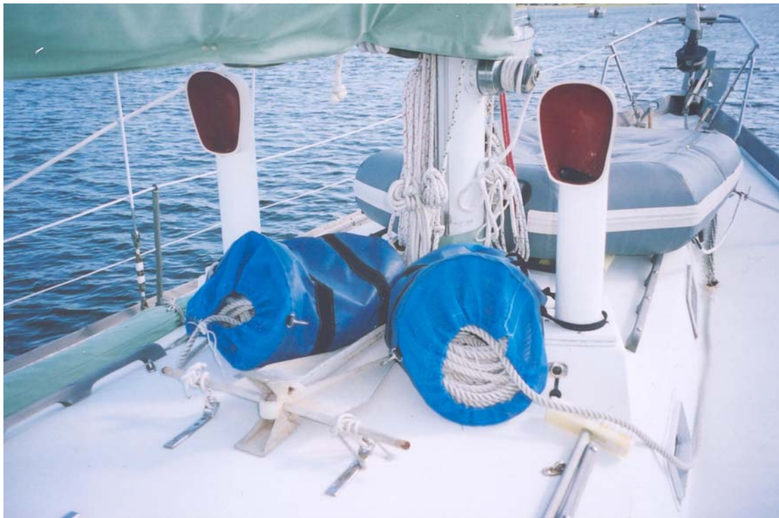
A spare Danforth anchor is carried on the cabin top. Anchor rodes are neatly contained in canvas bags. The tall cowl ventilators and large Dorade boxes provide good ventilation.