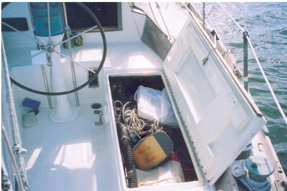
Large cockpit lockers provide stowage for sails and other gear.