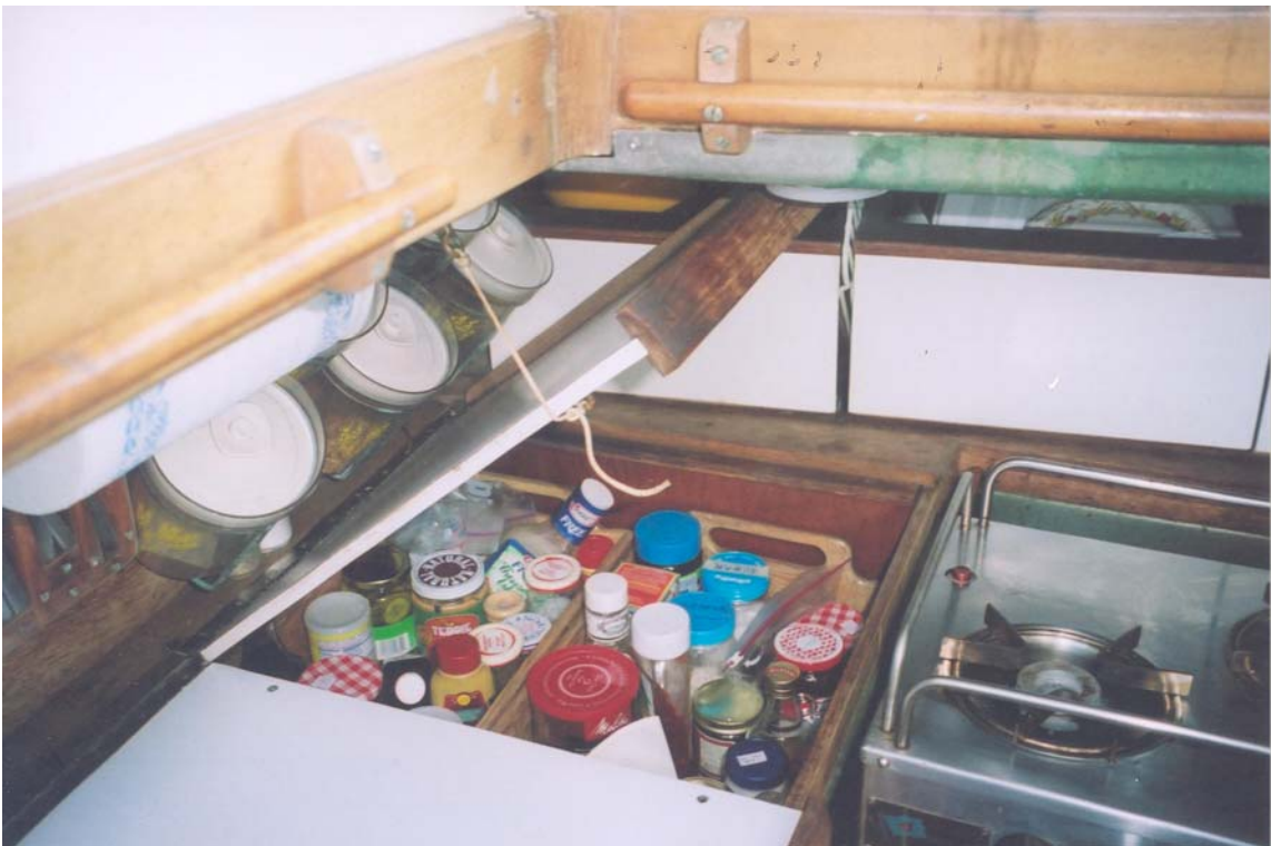
The hinged counter top lifts for access to sliding trays and storage underneath.