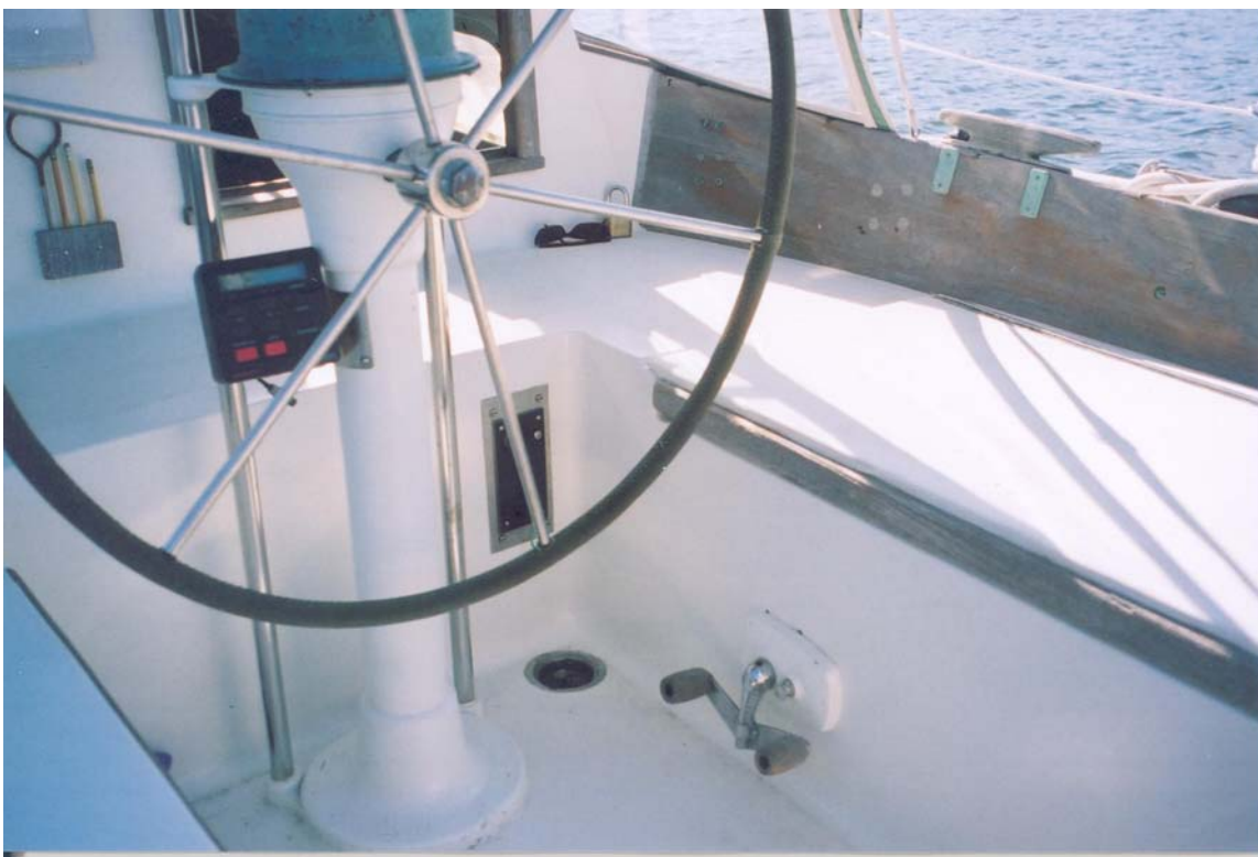
The novel foot pedal actuates the throttle and reverse gear.