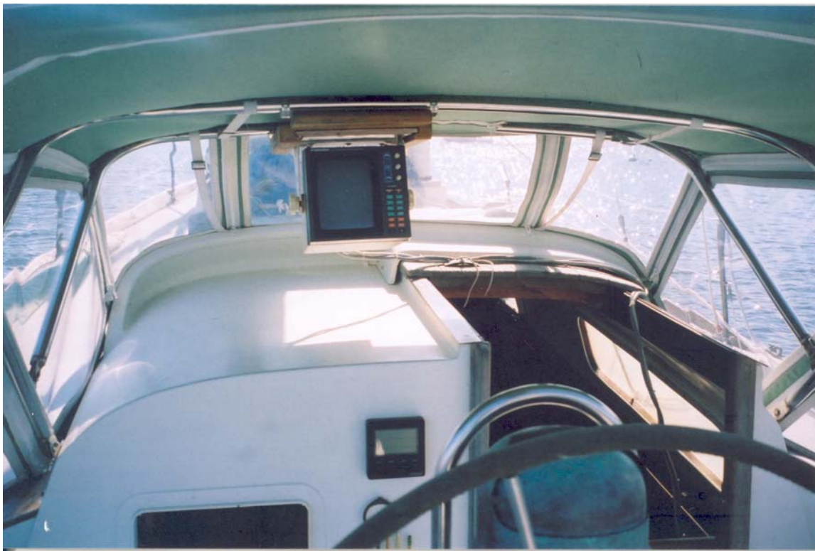
The radar display is mounted on the underside of the dodger.