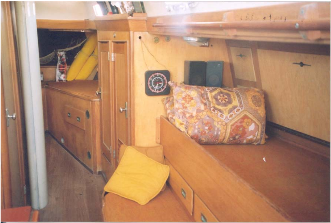
These two views of the main cabin show the wood interior and large lockers.