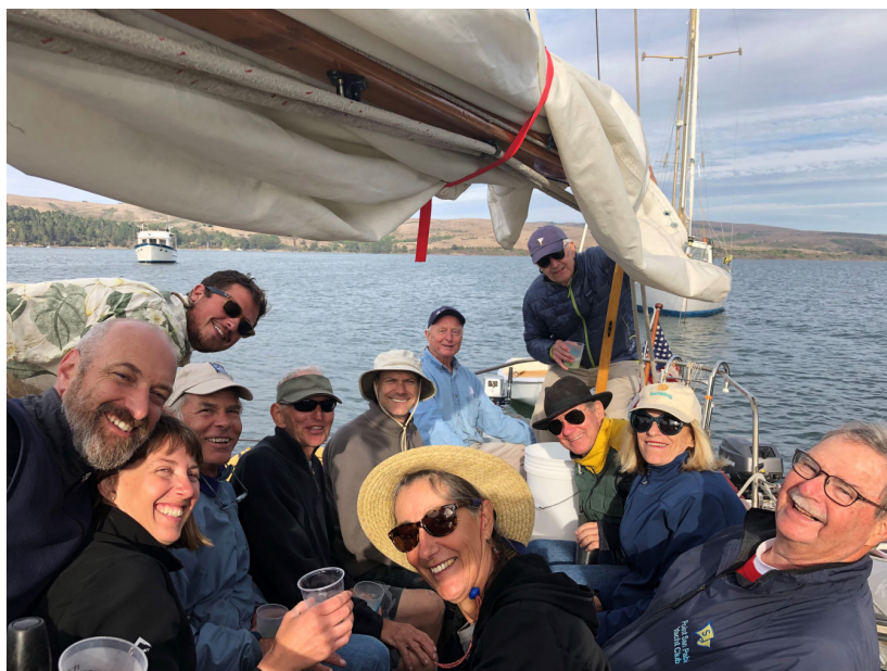
Aboard Nautigal 2018